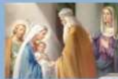
Saint Simeon's Prophecy