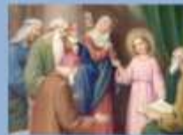
The Loss of Jesus In The Temple