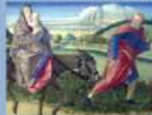
The Flight to Egypt