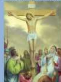
The Crucifixion and Death of Jesus