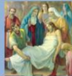
The Burial of Jesus

Reflecting on Mary's Seven Sorrows A Walk for the Reparation for Sin and Conversion of Sinners