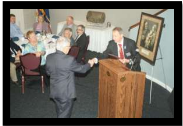
Past State Deputy