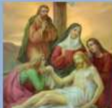
The Piercing of the side of Jesus, and His Descent from the Cross