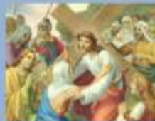
The Meeting with Jesus on the Way to Calvary